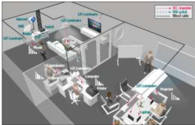
Figure 3. The proposed Li+WiFi HetNet.[7]

primary characteristics of both technologies and the possibility for them to coexist. That both technologies(Wi-Fi + Li-Fi) together can more than triple the throughput for individual users and offer significant synergies, yielding highest data rates needed in the 5th generation of mobile networks (5G).This technology require more hardware and consumes more power, So expensive.