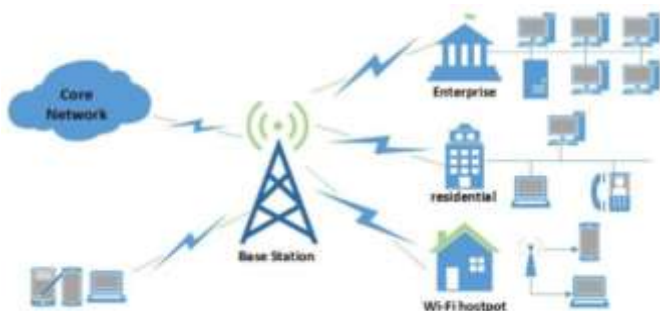
Figure 1. Wireless coexistence (WiFi, WiMAX and 2G/3G)[4]

This paper introduced two technologies and make comparisons between WiMAX and Wi-Fi[4]. In this paper the Wi-Fi and WiMAX technologies and then their own characteristics are compared and the coexistence of Wi-Fi and WiMAX is analyzed. They used OPNET Modeler software and the wireless coexistence deployment is evaluated with output graphs. Finally, conclusion is made by discussing the future of WiMAX in relation to Wi-Fi.