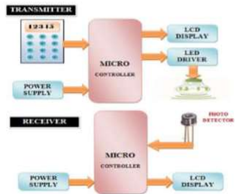
Figure 4. Block Diagram of The Proposed System.[8]

This paper presented the system which uses the light is the communication medium between the two ships which is underwater communication [8]. The existing technology uses electromagnetic wave, due to which communication can be established at higher frequency and bandwidth. This causes high absorption/attenuation that has adverse effect on the transmitted signals. Big antenna also needed for this type of communication which increases design complexity and cost. Due to absorption characteristics of sea water ultrasound is not used for underwater communication. Unwanted noise signal may be present. To overcome this problem Li-Fi system is used. Li-Fi system can be used for minimizing the disadvantages of ultrasound underwater communication. Due to high speed of light, Light signals can travel long distance without any obstruction in water. For Long Distance communication, they use the LASER in place of LED. So the communication distance can be increased. At the receiver section they used Photo detector which accepts the signals or string light signals from the LED and it process it. After the Photo detector the signals is applied to the amplification and signal processing to get the actual transmitted signal. At the receiver side they also connected the LCD display to verify the actual transmitted signal. This is system easy to implement, helpful for less power application and for transmit secured data.