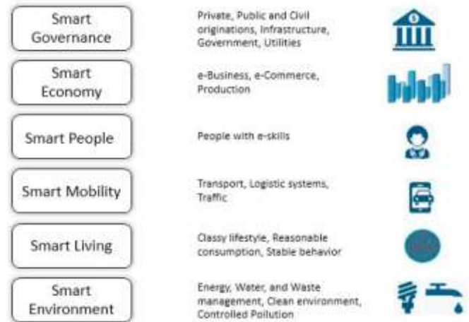
Fig 3 Six Dimension of smart city