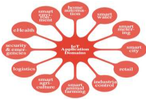
Fig 1: IOT Application