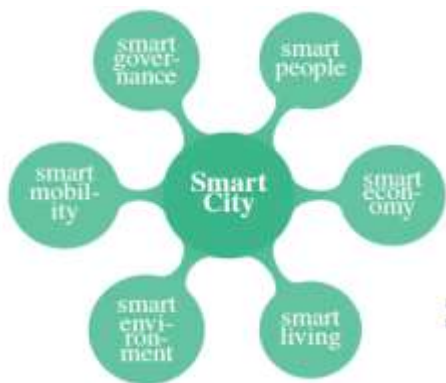
Fig 2: Smart City

A Smart City as a city which functions in a sustainable and intelligent way, by integrating all its infrastructure and services into a cohesive whole and using intelligent devices for monitoring and control, to ensure sustainability and efficiency. This interpretation makes evident, therefore, that Smart City concept