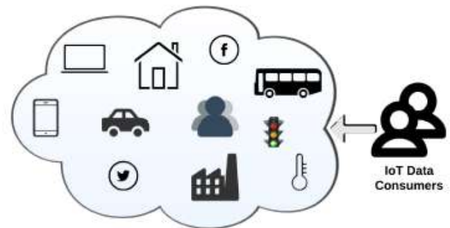
Fig 4 Cloud Computing Things

Cloud computing is basically an Internet-based network made up of large numbers of servers - mostly based on open standards, modular and inexpensive. Clouds contain vast amounts of information and provide a variety of services to large numbers of people. The benefits of cloud computing are Reduced Data Leakage.