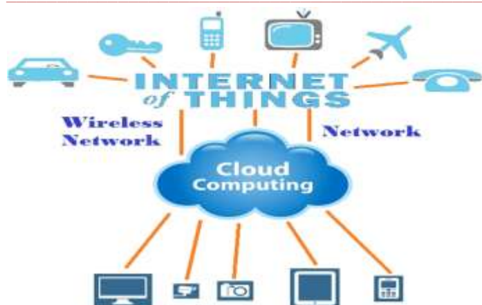
Fig 6: Design Architecture for Smart cities