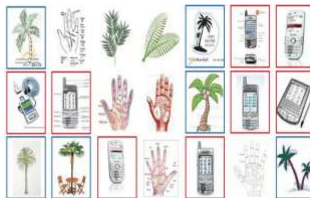
Figure 3. An example of content-based image ranking result with many irrelevant images among top-ranked images. The query keyword is “palm” and the query image is the top leftmost image of “palm tree.”

rankers, the output is equivalent to a weighted combination of the n similarity measurements.