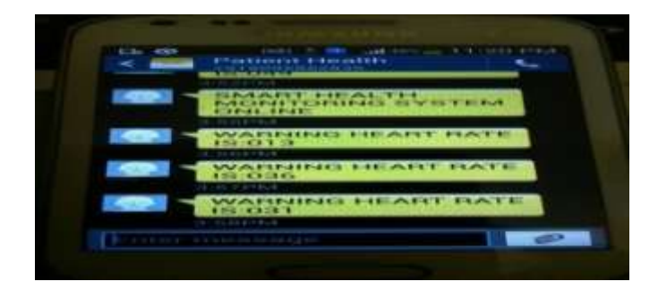
Figure5(c): Message sent to the doctor cell phone when system online and during extreme conditions