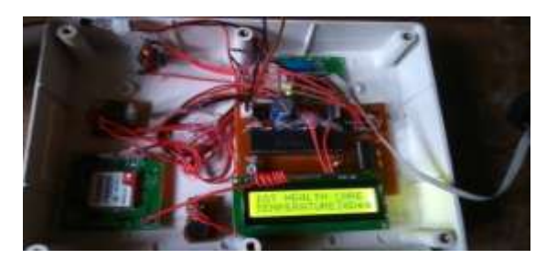
Figure5(a): Designed system as with reference to block diagram proposed has shown in Figure3.

The Designed system is as shown in the Figure5 (a).Following process goes on step by step when hardware is powered.