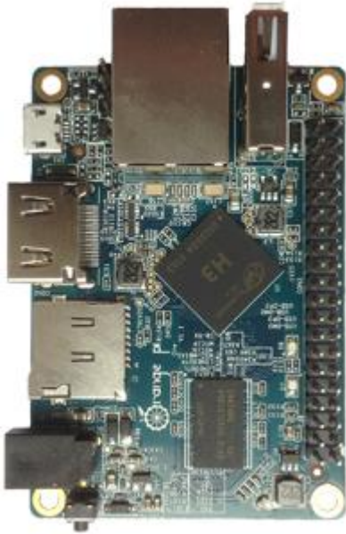
Fig: Orange Pi One