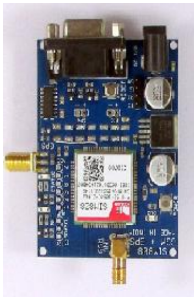
Fig: GSM/GPRS/GPS Module

The GPS module is responsible for providing the Geo-coordinates to the Google Maps API whereas the GSM/GPRS is responsible for providing the Google Maps API with data connectivity to enable it to communicate with the Google Maps servers.