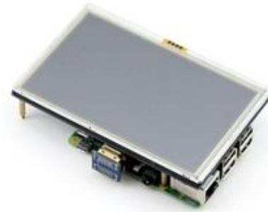
Fig: LCD Module

A small 10in LCD module is required to display the advertisements. HDMI support is preferable for easy interfacing with the Orange Pi Board.