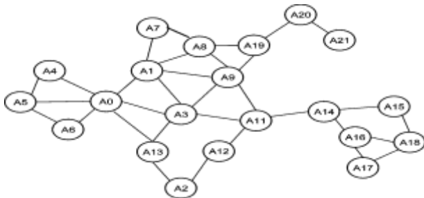
Figure 2. How DARA [3] restores connectivity after the failure of node A10 in the connected inter-actor topology of Fig. 1.