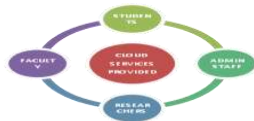
Figure1. IAAS MANAGEMENT (SERVICE MODEL)

The initiation of cloud computing in education is still at a budding stage. The research now particularly spotlights on the analytical aspects of the cloud computing applications, describing some current and accomplished educational and research products. The successful applications of cloud computing models at educational institutions have been estimated only to a partial extent. With this point of view our paper takes a baby step by bringing together the various definitions of cloud computing in the education with a innovative way to implement cloud computing. To stress upon this paper emphasizes the innovative technique of using educational cloud computing for providing smarter education. This paper studies various aspects like characteristics of the educational platform and flexibility for all universities, and educational institutions. In addition, this paper presents different educational applications for education infrastructures implement for using in academic section. The cloud computing in education will resolve not only from an academic point of view but also on following important attributes like:-