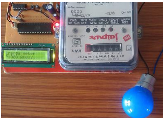
Fig.4 Examining System

In the place of conventional power meter the proposed system is tested and achieved good results. For display purpose, 60Watt bulb is made used as load in the direction of examining our system. The bulb is attached to load and the Energy meter which is used to calculate