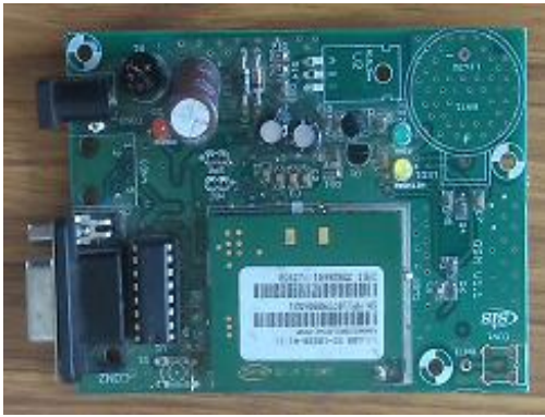
Fig.3 GSM Module