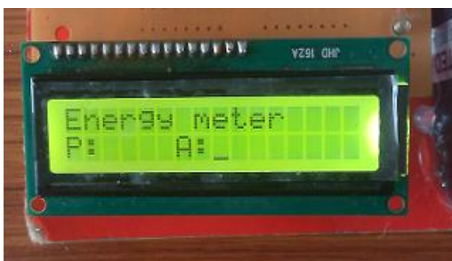
Fig. 5 Initial meter reading in LCD display

the information of average real power, revealed in Fig.4. The examination is performed and power consumption is experiential. For the duration of this period the bulb glows constantly. Fig.5 Shows the initial meter reading and Fig.6 shows the the number of units consumed and the bill amount displayed in the LCD display.