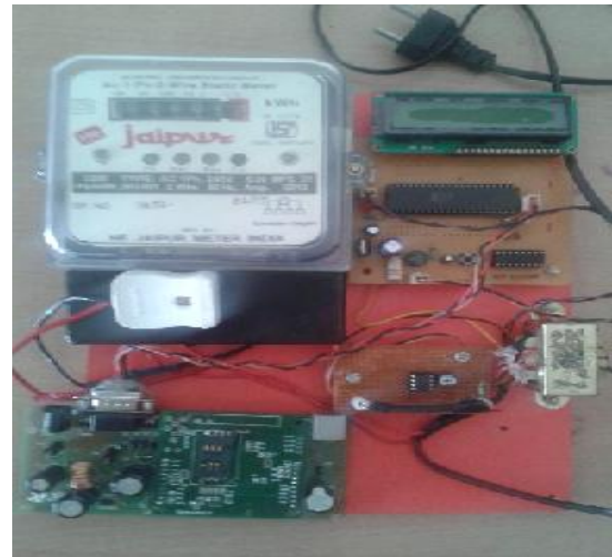
Fig.2 Working model of automatic meter reading