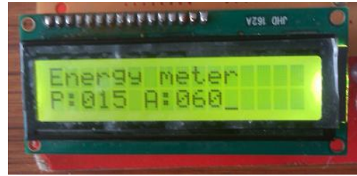
Fig.6 Meter reading on LCD display after the consumption of power

. Subsequent to the due date, the LPC2148 controller turned off the bulb all the way through the relay, which proves the accurateness of our system in terms of the power and estimation of remote controlling.